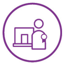
Registered Child Care Supervisor 註冊幼兒中心主管