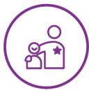
Registered Special Child Care Worker 註冊特殊幼兒工作人員