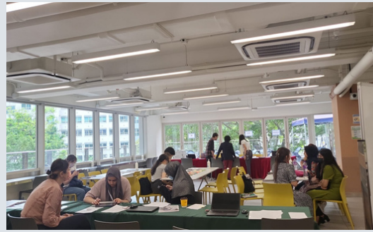
Kowloon Tong Admission Centre 九龍塘收生中心

每年的年度招生活動是我們學院最重要的活動。它安排在公布DSE成績的時候，我們的大門向所有DSE學生敞開，讓他們可以在同一地點進行申請、面試和領取錄取通知。今年的活動從7月19日持續到24日。我們的教職員工日以繼夜地工作了數月，確保申請過程無瑕疵，申請者可以在截止日期之前完成報名。今年的競爭非常激烈，競爭對手在推廣其課程方面越來越積極。我們在履行過程中加強了提案，包括：承諾在15分鐘內完成面試和領取錄取通知、簡化文件驗證過程、通過雲端遠程技術減少準備和相關程序的人力成本，節省了1.5天人力、將主要運營集中在一個地點，並促進靈活的溝通。