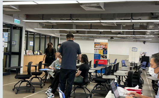
Tin Wan Admission Centre 田灣收生中心